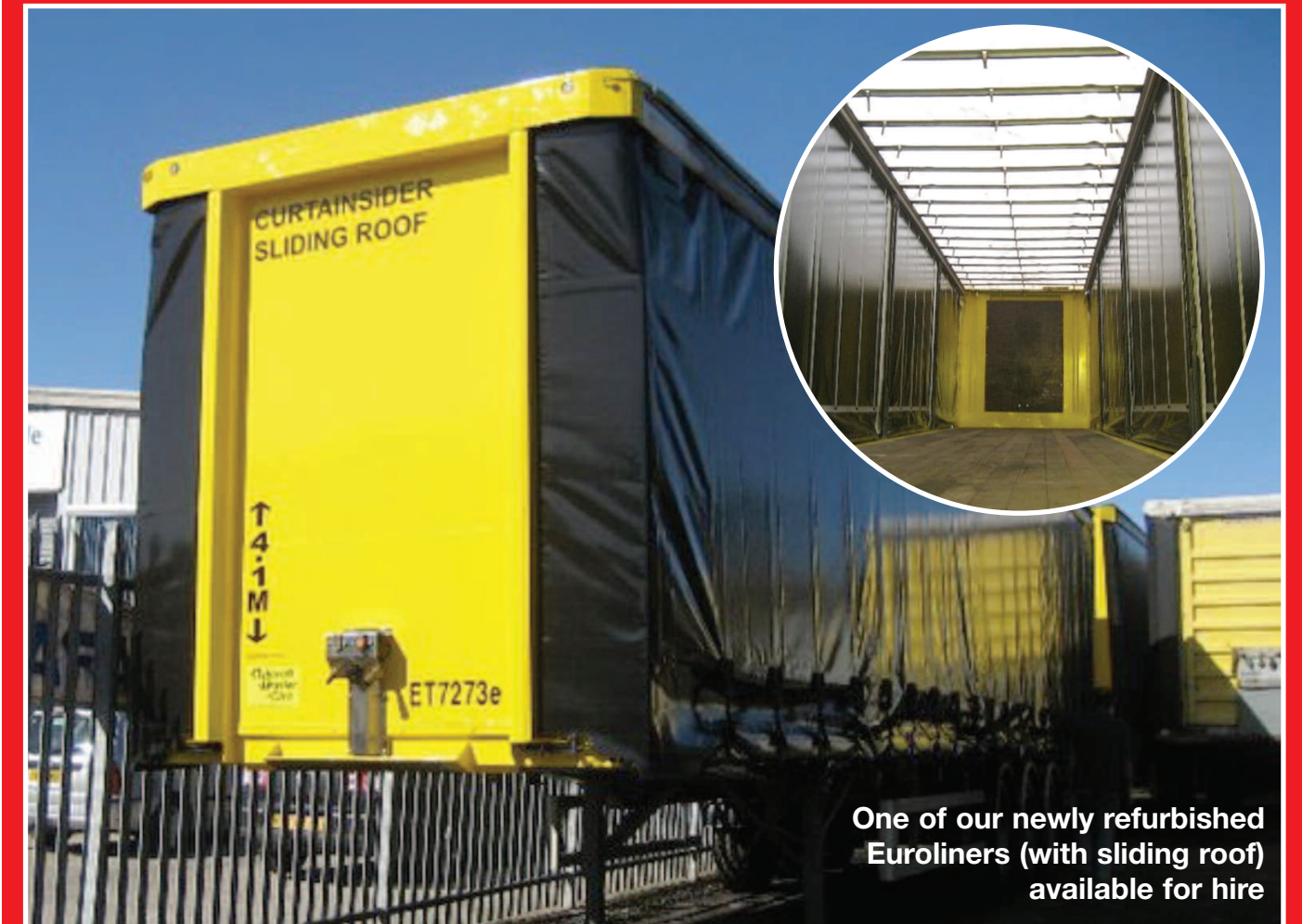
One of our newly refurbished Euroliners (with sliding roof) available for hire

We are capable of tackling all of your needs and meeting your expectations. With our vast wealth of experience we bring to each task, this enables us to offer the best service to our customers. For more information regarding our range of services and products, please don't hesitate to contact us today.