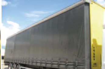
TAUTLINER OR CURTAINSIDE