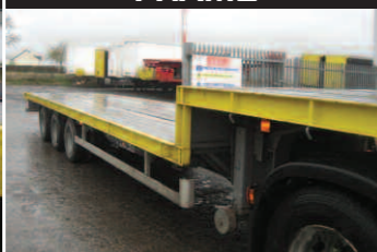
EXTENDABLE DROP FRAME