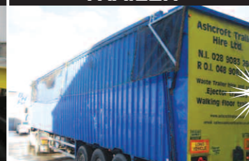
WALKING FLOOR TRAILER