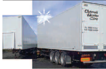
DRY FREIGHT BOX VAN