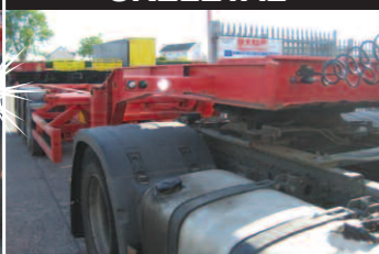
DROP FRAME SKELETAL