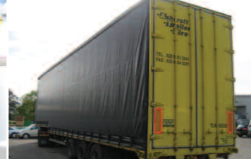
DOUBLE DECK CURTAINSIDE