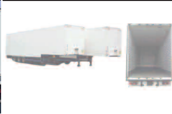
GARMENT DROP FRAME BOX VAN