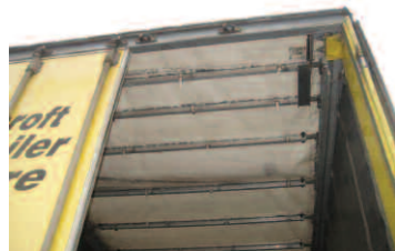
EUROLINER - SLIDING ROOF