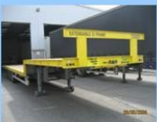
Drop frame extendable