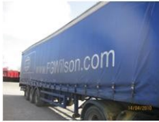
Euroliner - £3800