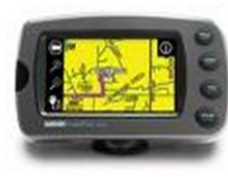
Garmin satnav 2620 - £75