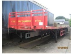
PSK Flat - £2250